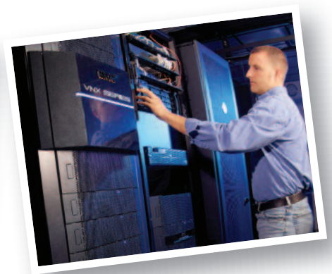
Data Transmission & Storage

*Equipment monitoring & maintenance available with DDS Preferred Program.