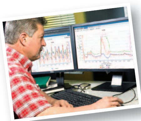
Real-time Access to Data for Analysis