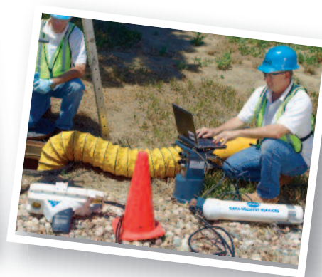
Monitoring & Maintenance*