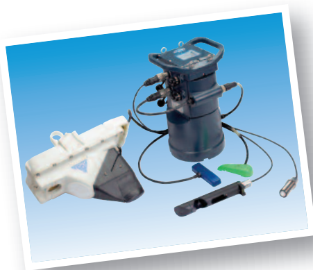
All Necessary Equipment