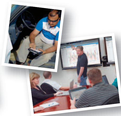
Convenient Data Access Anywhere