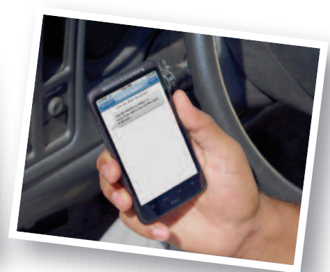
Instant Alerts on Flow Changes